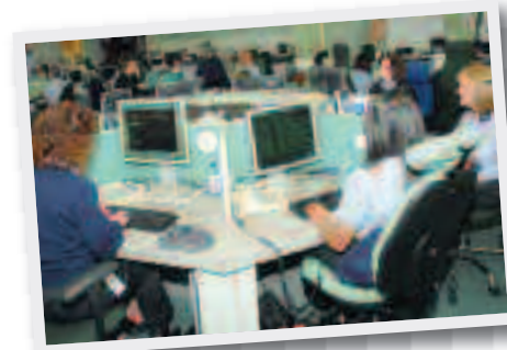
Bedfordshire Call Handling Centre

Another new service being considered is an SMS texting service, allowing the public and to communicate by text message. This is initially going to be trialled with the hard of hearing community.