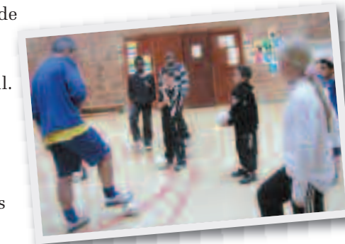
Activities: Brazilian football

In response to complaints from residents, an anti-speeding initiative caught 65 motorists. Thirty vehicles were seized after being driven with no insurance or driving licence and scores of off-road nuisance bikers were caught.