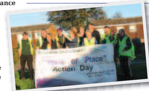
Pride in Parkside

The local community is reassured to know that should such problems occur, action will be taken. This sends a stern message that this sort of behaviour will not be tolerated.