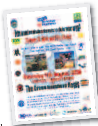
Activities Day Poster