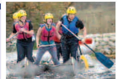
Cadets at Kempston's Outdoor Centre

"The Police Authority's Youth Issues Group supports projects which are designed to keep young people off the streets and out of trouble, and has helped sustain a wide variety of diversionary activities for young people, from skateboarding and theatres, to advice centres.